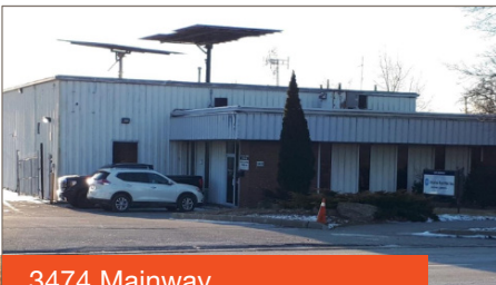
3474 Mainway Burlington

Price Price PSF $6,500,000 $289 Size 22,477 SF