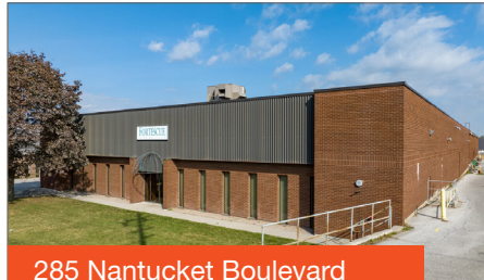
285 Nantucket Boulevard Scarborough

Price Price PSF $48,330,730 $145 Size 332,580 SF