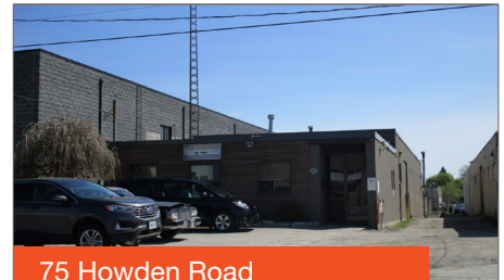
75 Howden Road Scarborough

Price Price PSF $11,600,000 $264 Size 44,000 SF