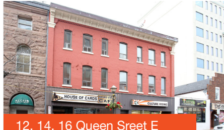
12, 14, 16 Queen Street E Brampton

Price $7,100,000 Price PSF $392 Size 18,127 SF