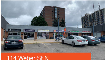
114 Weber St N Waterloo

Price $7,100,000 Price PSF $392 Size 18,127 SF