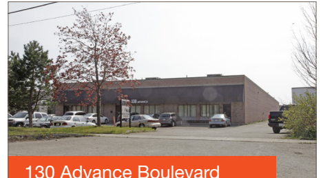
130 Advance Boulevard Brampton

Price Price PSF $14,250,000 $124 Size 115,350 SF