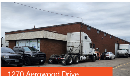
1270 Aerowood Drive Mississauga