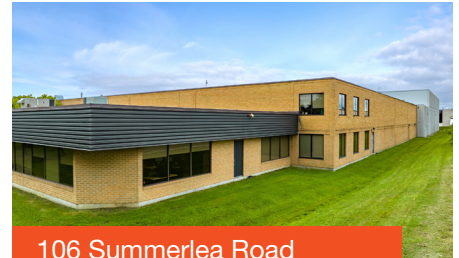
106 Summerlea Road Brampton