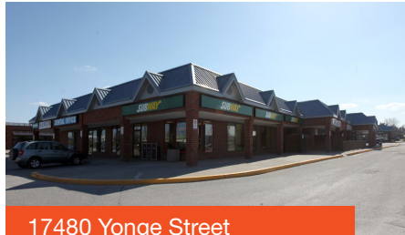
17480 Yonge Street Newmarket