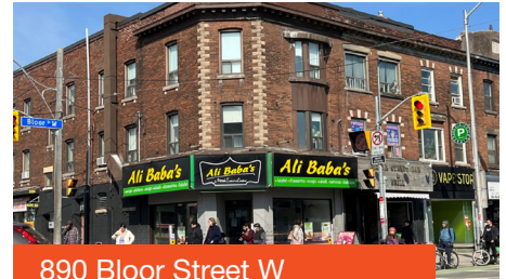
890 Bloor Street W Toronto