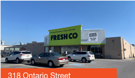
318 Ontario Street St Catharines