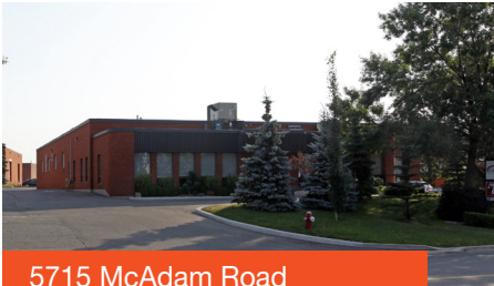
5715 McAdam Road Mississauga