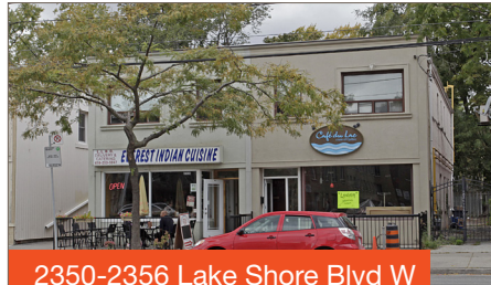
2350-2356 Lake Shore Blvd W Toronto

Price Price PSF $1,370,000 $669 Size 2,047 SF