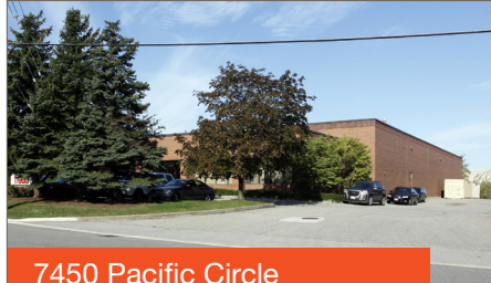
7450 Pacific Circle Mississauga

Price $7,550,000 Price PSF $495 Size 15,242 SF