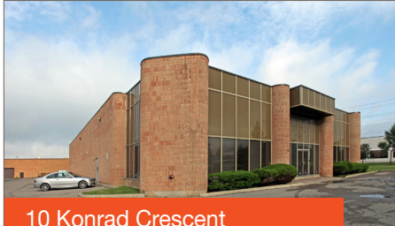
10 Konrad Crescent Markham

Price $7,550,000 Price PSF $495 Size 15,242 SF