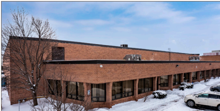
35 Valleywood Drive Markham

Price Price PSF $21,650,000 $350 Size 61,858 SF