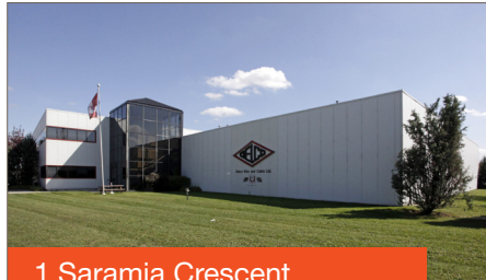
1 Saramia Crescent Vaughan

Price Price PSF $21,650,000 $350 Size 61,858 SF