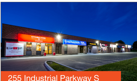
255 Industrial Parkway S Aurora

Price Price PSF $7,575,000 $384 Size 19,722 SF