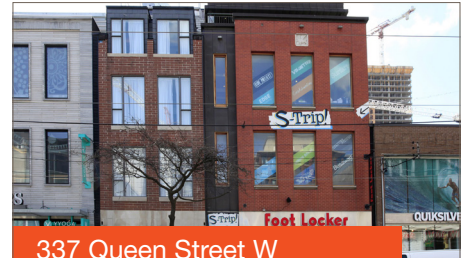
337 Queen Street W Toronto

Price $8,580,000 Price PSF $467 Size 18,380 SF