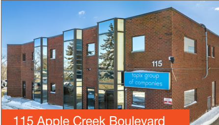
115 Apple Creek Boulevard Markham

Price $9,100,00 Price PSF $284 Size 32,096 SF