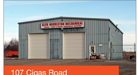
107 Cigas Road Clarington

Price $3,500,000 Price PSF $306 Size 11,445 SF