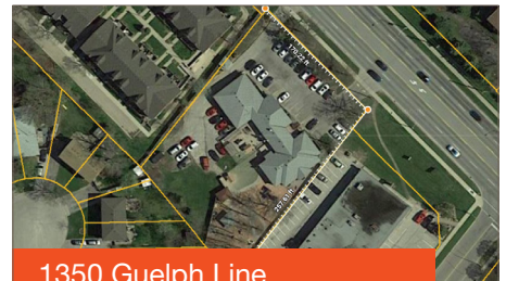
1350 Guelph Line Burlington

Price $1,200,000 Price PSF $315 Size 3,802 SF