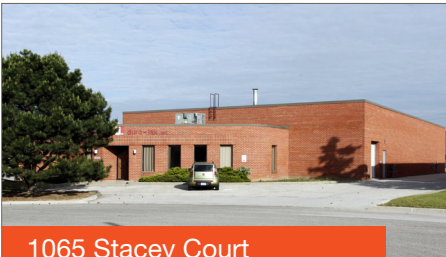
1065 Stacey Court Mississauga

Price $5,100,000 Price PSF $528 Size 9,650 SF