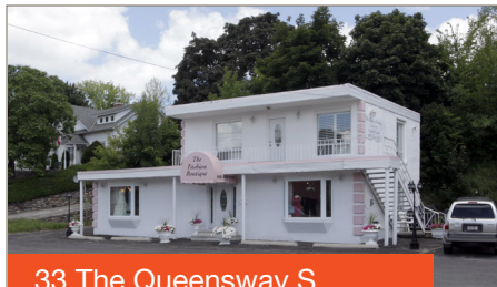
33 The Queensway S Georgina

Price $2,070,000 Price PSF $173 Size 12,000 SF